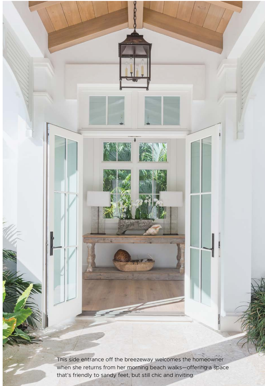
This side entrance off the breezeway welcomes the homeowner when she returns from her morning beach walks—offering a space that’s friendly to sandy feet, but still chic and inviting.

“Designing someone’s home is the most personal thing you can be asked to do. It requires total trust and commitment to the process. Our goal is for the home to be a reflection of the people who live there, their values, history, and dreams.”