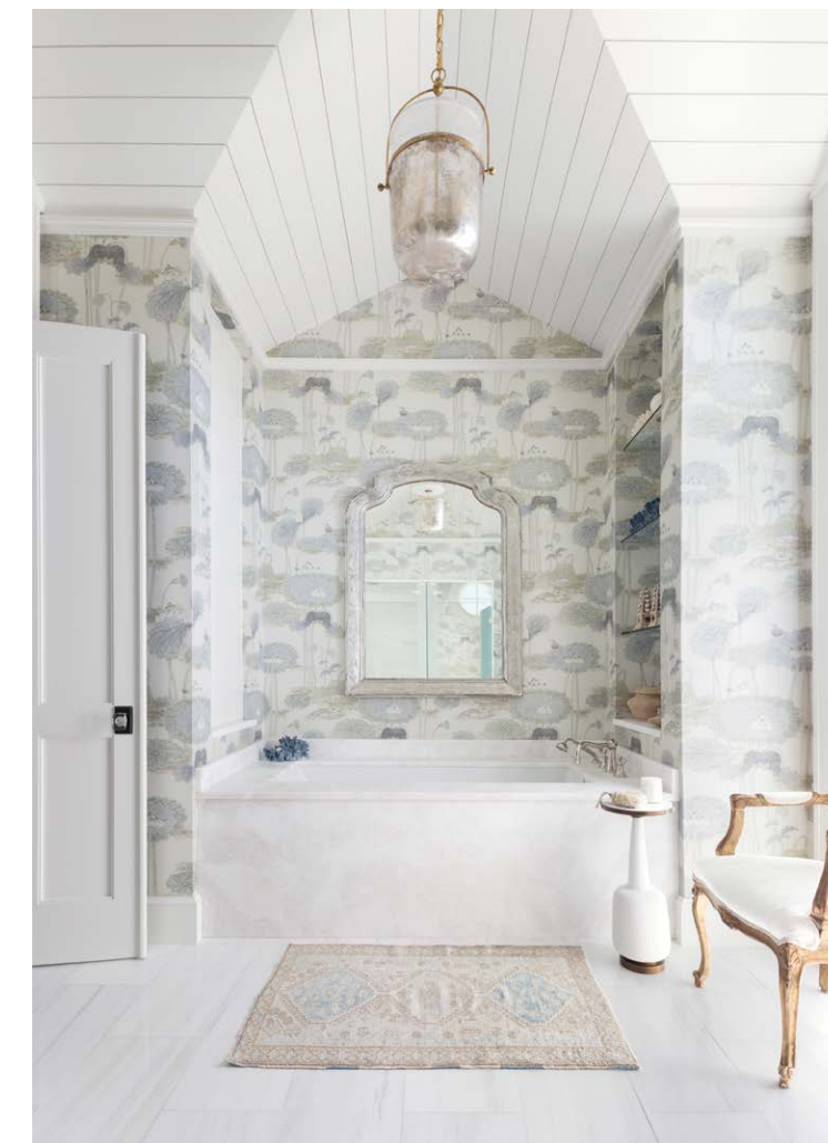
ABOVE: The Cowtan and Tout wallpaper with waterlilies and birds on a pale silvered grasscloth are highlighted by a mercury glass lantern. An antique Louis XVI mirror hangs over the custom tub. "The wallpaper, mirror, and lantern all offer what I like to call 'a little high heel' to the home. It is a little jewel box," says Thompson.

Directly opposite the new window is the outdoor terrace, decorated with natural and indigenous materials. "The feeling we were after was to allow the two areas to flow easily and be inviting and comfortable as if it were a family room," says Thompson.