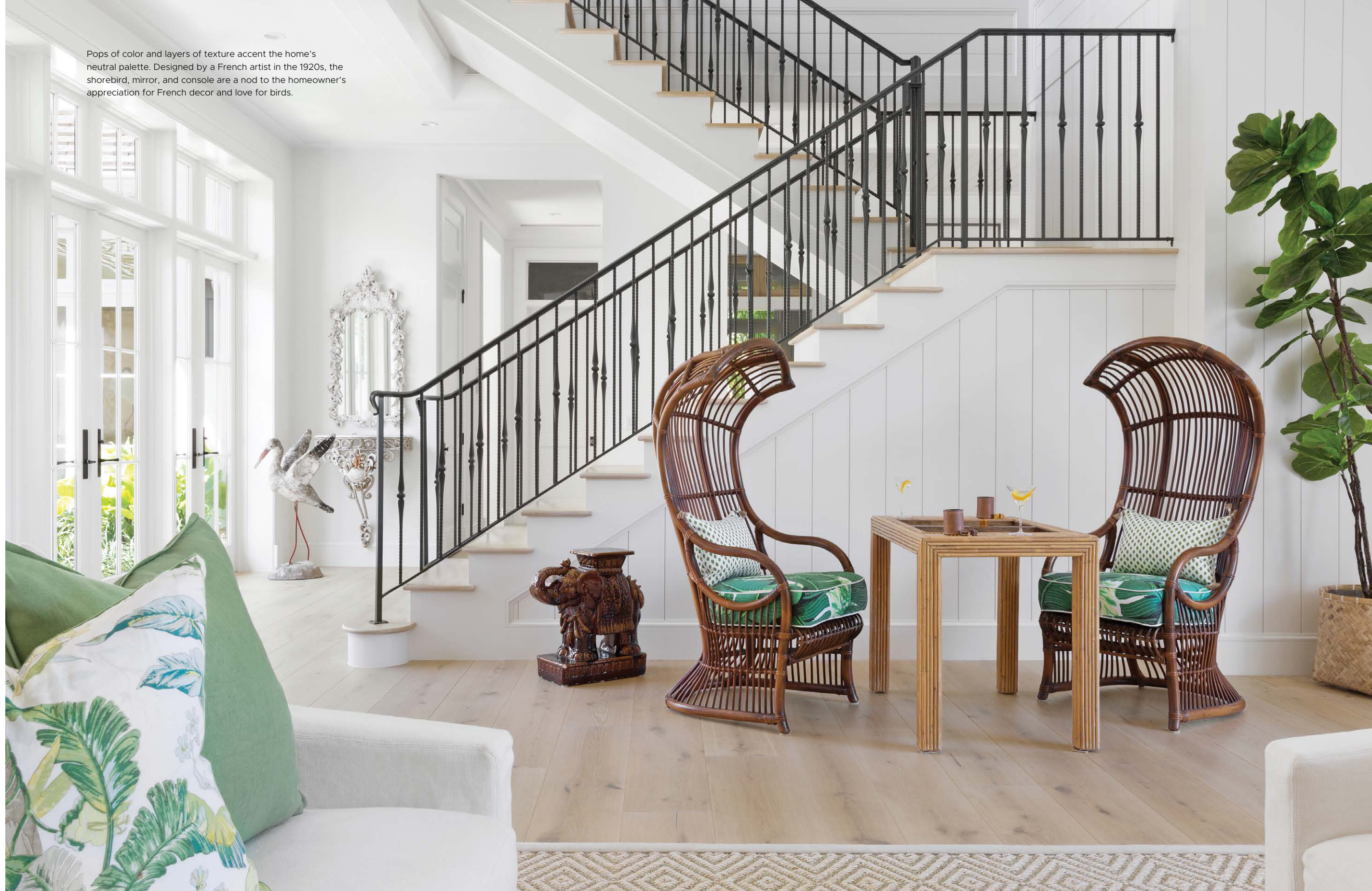
Pops of color and layers of texture accent the home’s neutral palette. Designed by a French artist in the 1920s, the shorebird, mirror, and console are a nod to the homeowner’s appreciation for French decor and love for birds.